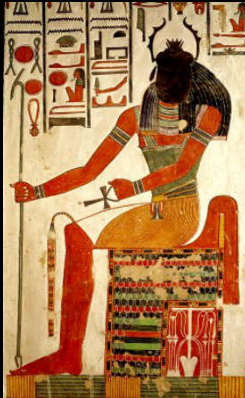
Khepri, god of Renewal