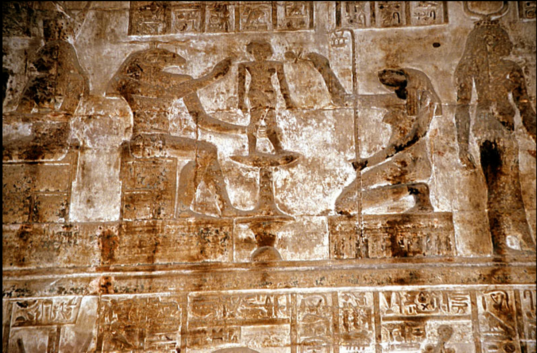
Heqet, fertility goddess